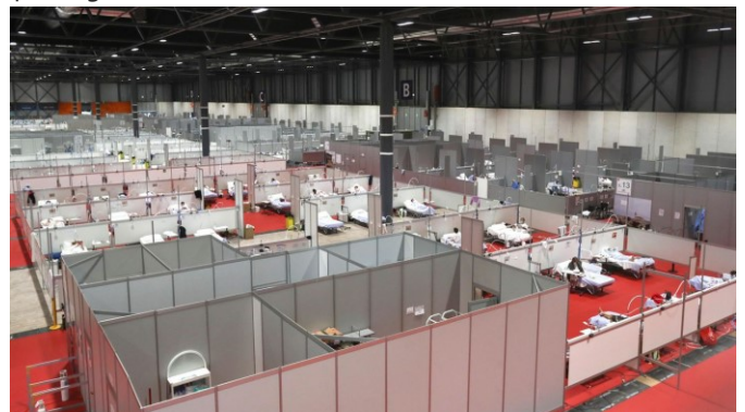
The field hospital set up at Ifema, Madrid's exhibition center.

The first COVID-19 active case in Spain was confirmed on 31 January 2020. The Spanish government declared a state of emergency on March 14, issuing a nationwide confinement order. Non-essential shops, schools, hotels and tourist accommodation were ordered to shut completely for two weeks, then workers in construction and manufacturing were allowed to return to work, although other restrictions were extended for the general citizens. Spain also closed its external borders with its European neighbours. Medical professionals and those who live in retirement homes have experienced especially high infection rates. On 25 March the death toll in Spain surpassed that of mainland China. The actual number of cases and deaths is believed to be an underestimate due to lack of testing and reporting.