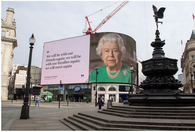
A message from the Queen Elizabeth II in Piccadilly Circus.